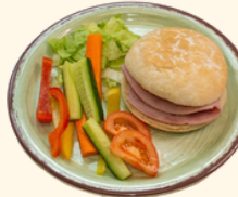
British Ham (G)