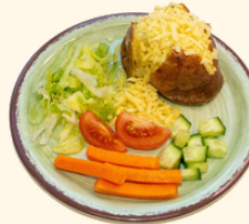
(v) Cheese (D)