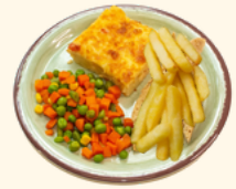
(v)(h) Cheesy Omelette (E.D)