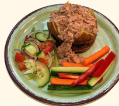
Tuna Mayonnaise (F.E)