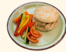
British Roast Chicken (G)