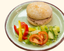
Tuna Mayonnaise (F.E.G)