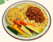
(h) Beef Bolognese (G.D)