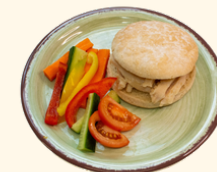
British Roast Chicken (G.)