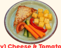
(v) Cheese & Tomato Pizza Wedge (G.D)