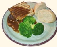
(v)(h) Vegetable Cottage Pie (G.D.SB)