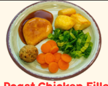
Roast Chicken Fillet Stuffing ball (G)