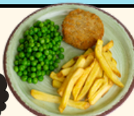
Salmon Fishcake (F.G)