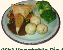
(v)(h) Vegetable Pie (G)