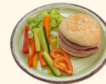
British Ham (G)