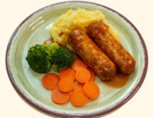
(v) Plant Power Sausages (D)