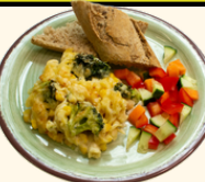
(v)(h) Broccoli & Sweetcorn Pasta (D.G)