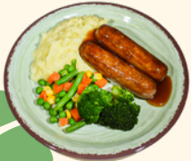
Pork Sausages (G.SU.SB.D)