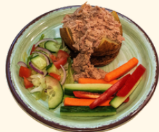
Tuna Mayonnaise (F.E)