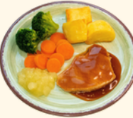
Roast Pork, Apple Sauce