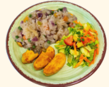
(v) Quorn Dippers (G)