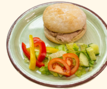
Tuna Mayonnaise (F.E.G)