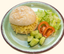
(v) Cheddar Cheese (G.D)