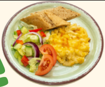
(v)(h) Mac 'n' Cheese (G.D)