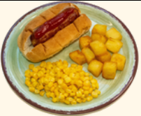
Pork Hot Dog (G.SU.SB)