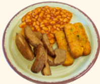
(vg) Garden Vegetable Fingers (G)