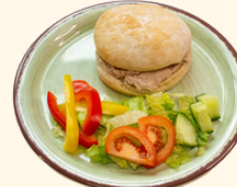
Tuna Mayonnaise (F.E.G)