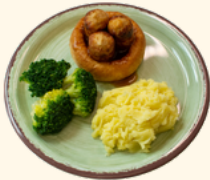
(v) Plant Power Toad in the Hole (G.E.D)