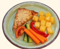
(v) Cheese & Tomato Pizza Wedge (G.D)