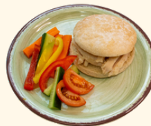
British Roast Chicken (G)