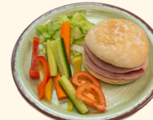
British Ham (G)