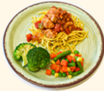
(v)(h) Chines Style Quorn (E)