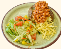
(v) Cheese/Beans (D)