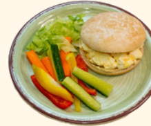
(v) Egg Mayonnaise (G.E)