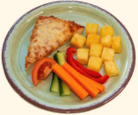
(v) Cheese & Tomato Pizza Wedge (G.D)