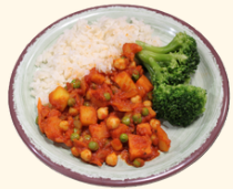
(v)(h) Vegetable Curry