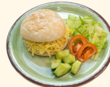
(v) Cheddar Cheese (G.D)