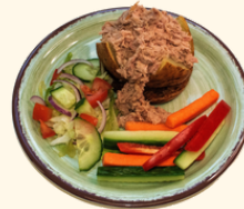
Tuna Mayonnaise (F.E)