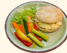
(v) Egg Mayonnaise (G.E)