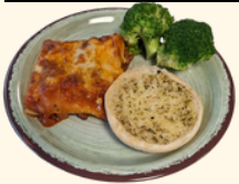
(h) Beef Lasagne (G.D)