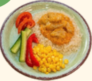
(h) Mild Chicken Curry