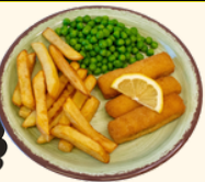
Fish Fillet Fingers (F.G)