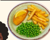
Battered Fish Fillet (F.G)