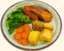
(vg) Quorn Roast Stuffing ball (G)