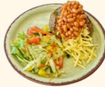
(v) Cheese/Beans (D)