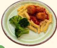
Park Meatballs in Tomato Sauce (G)