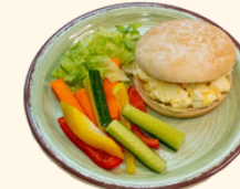
(v) Egg Mayonnaise (G.E)