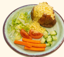
(v) Cheese (D)