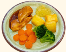
(vg) Quorn Roast, Apple Sauce (G)