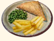
(v)(h) Cheese & Baked Bean Pasty (G.D)