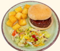
(vg) Plant Power Burger (G)