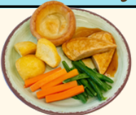
Roast Chicken Fillet Yorkshire Pudding (G.E.D)